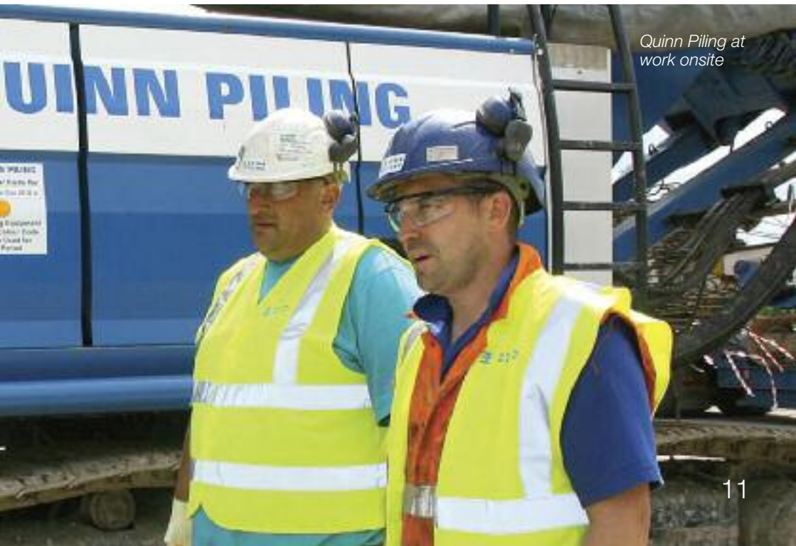
Quinn Piling at work onsite